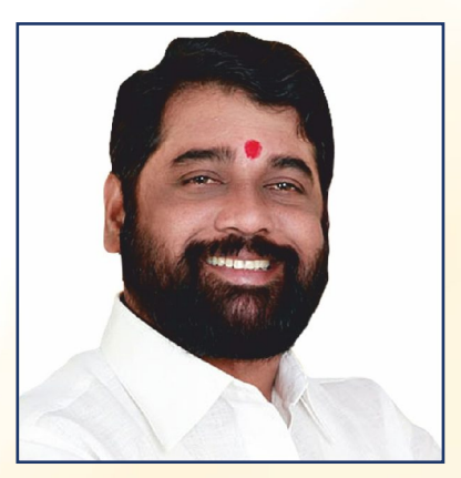
Hon. Shri. Eknath Shinde Chief Minister, Maharashtra State