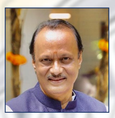
Hon. Shri. Ajit Pawar Dy. Chief Minister, Maharashtra State